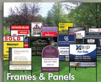
Frames & Panels