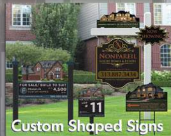
Custom Shaped Signs